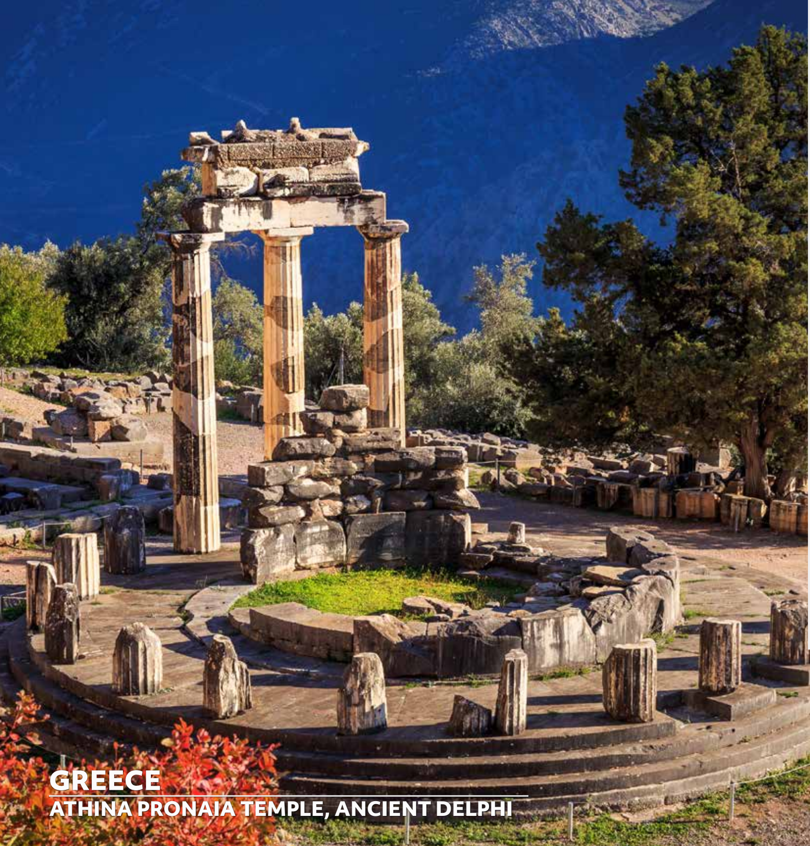
GREECE ATHINA PRONAIA TEMPLE, ANCIENT DELPHI