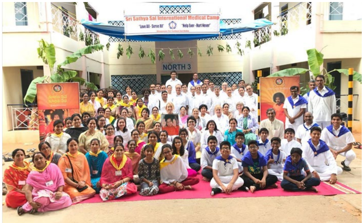
Medical and Non-Medical Volunteers

Volunteers: 60 volunteers assisted the Camp with all non-medical duties such as registration, patient flow, vital signs recording (weight and blood pressure), translation from Telugu, Hindi, Spanish into English and vice versa, and pharmacy tasks. In addition, Seva Dals from the Andhra Pradesh state cadre were deployed by their units to help out the camp.