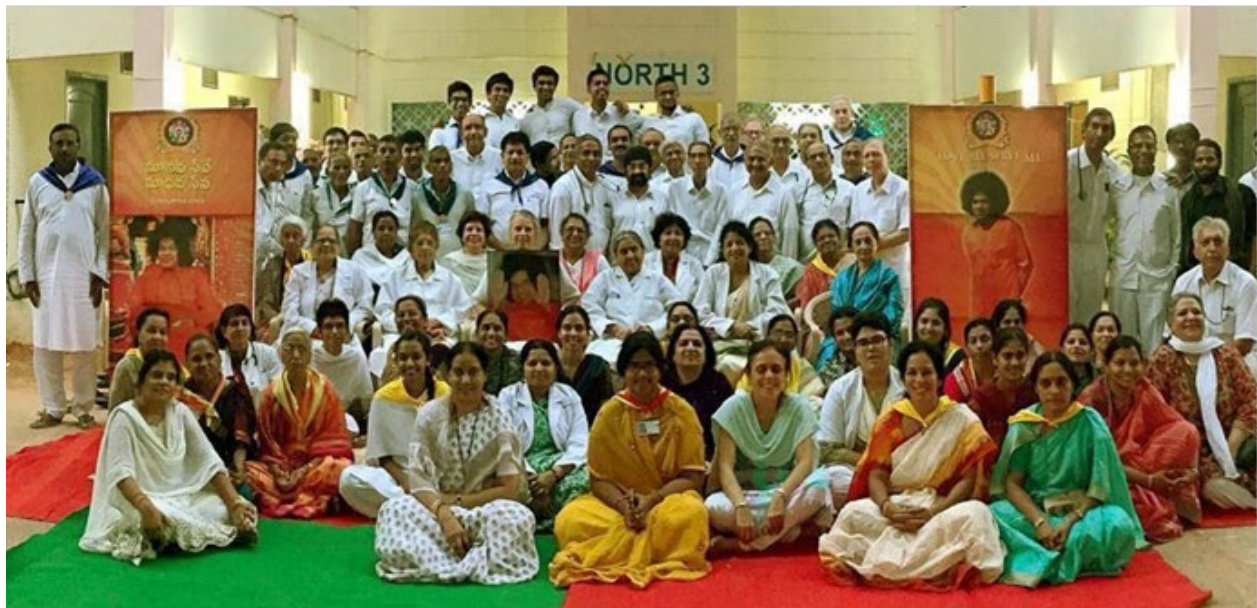
Medical and Non-Medical Volunteers

Volunteers: 46 volunteers assisted the Camp with all non-medical duties such as registration, patient flow, vital signs recording (weight and Blood Pressure), translation from Telugu, Hindi, Spanish into English and vice versa, and pharmacy tasks. In addition, Seva Dals from the Andhra Pradesh state cadre were deployed by their units to help at the camp.