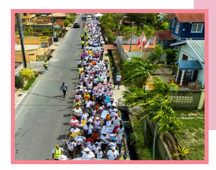
On May 6, 2023, five Sathya Sai Schools in Trinidad and Tobago organized their first Walk for Values and Environmental Fair. The theme of the event in which over 350 people took part was "Building Communities of Character, One Step at a Time".