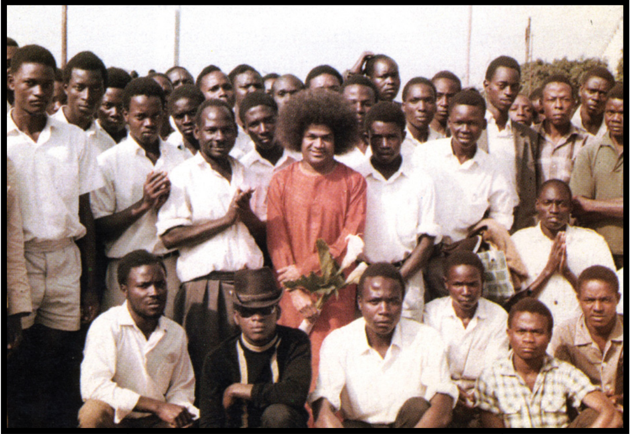
Photo from Sathya Sai Baba's 1968 visit to East Africa

Do not make distinctions between your people and other people. Consider everybody as a member of the universal Divine family. Experience bliss by cultivating the spirit of unity. Do not give scope for any differences whatsoever. Treat each body as a temple and offer your salutations. Have the firm conviction that God is present in all. When you cultivate such noble thoughts, God will certainly become manifest to you.